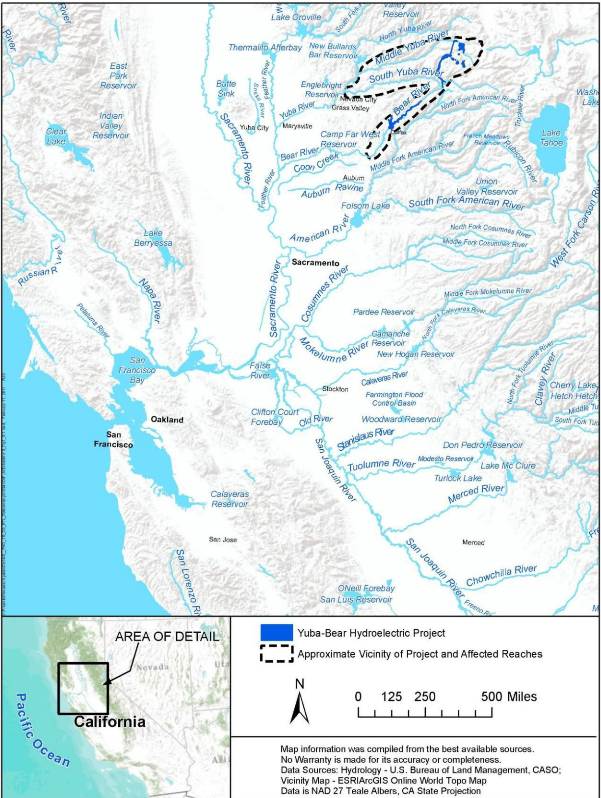
Figure 2-1. Location of the Yuba-Bear Hydroelectric Project.