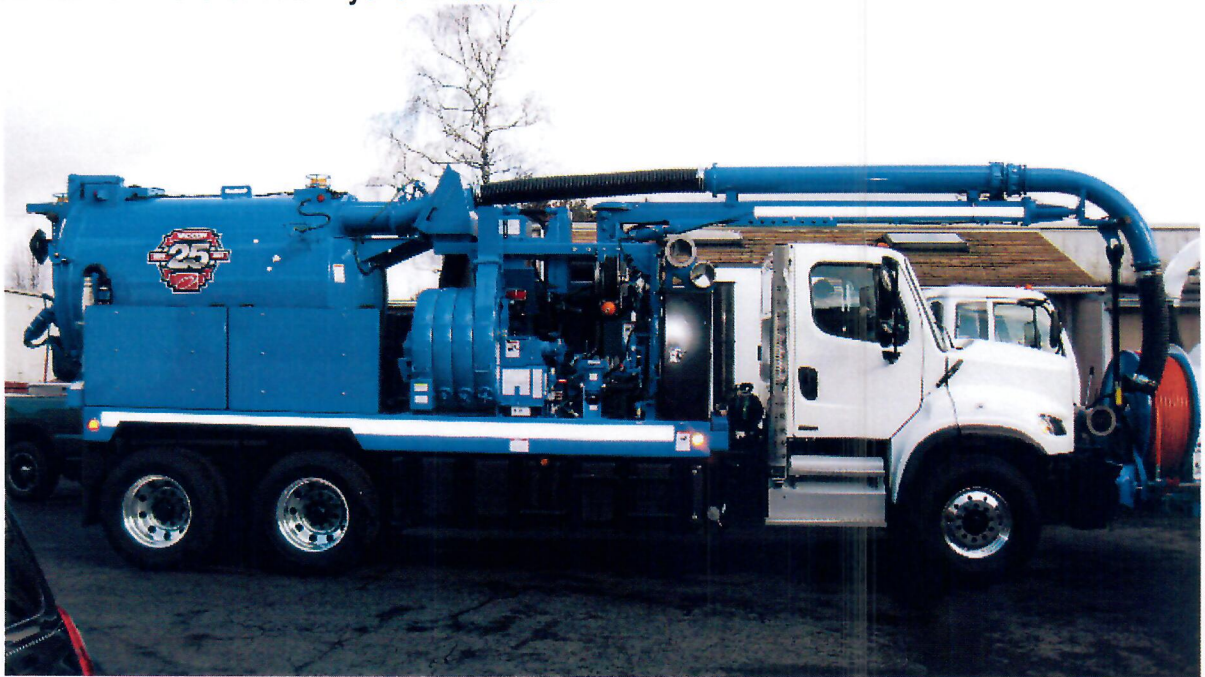
Representative Photo of NID Hydro Excavator