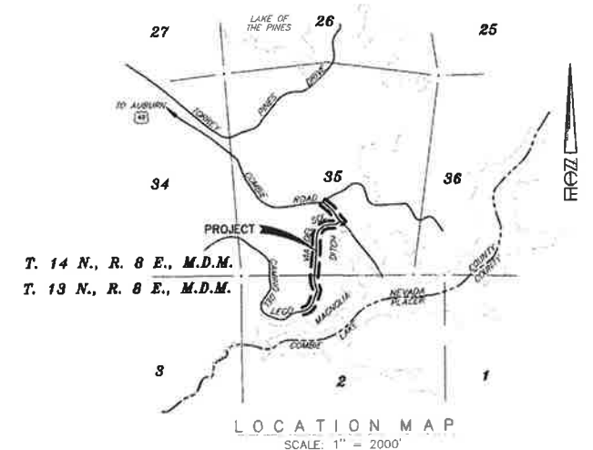
LOCATION MAP SCALE: 1" = 2000'