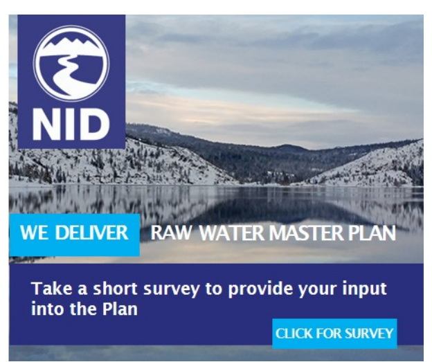
Yubanet Banner Ad – March 15 – April 30, 2020

In addition, Raftelis developed an on-line Survey Monkey questionnaire for further and wider community input. The questionnaire was promoted via the NID website, news releases, social media posts, newsletters, water bill inserts, and a Yubanet banner ad. The online survey was conducted between March 15, 2020, and April 30, 2020. The survey collected 487 responses. Of these, 320 self-identified as NID water customers.