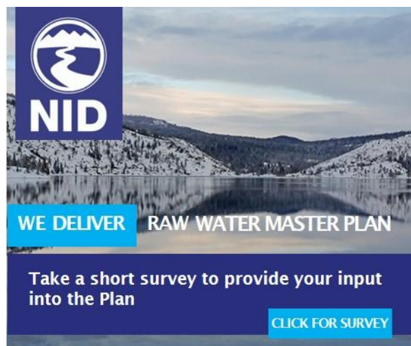
Yubanet Banner Ad – March 15 – April 30, 2020

In addition, Raftelis developed an on-line Survey Monkey questionnaire for further and wider community input. The questionnaire was promoted via the NID website, news releases, social media posts, newsletters, water bill inserts, and a Yubanet banner ad. The online survey was conducted between March 15, 2020 and April 30, 2020. The survey collected 487 responses. Of these, 320 self-identified as NID water customers.